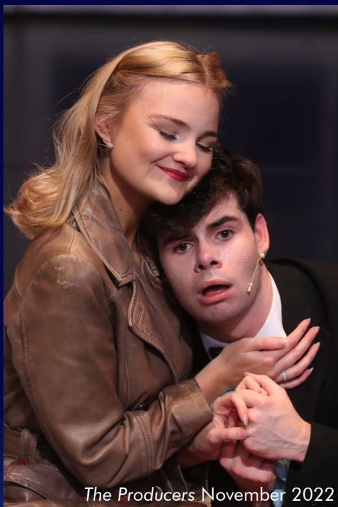
The Producers November 2022